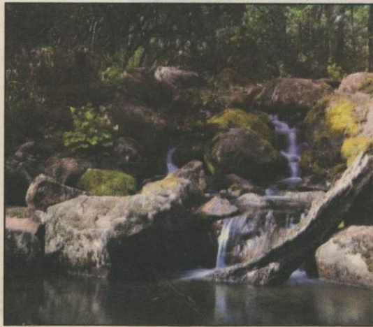
Guided tours of the Delbert Hunter Arboretum in Dallas City Park will be conducted Sunday, Aug. 1, from 8 a.m. to 4 p.m. The tours of the spectacular native plant areas and other features in the arboretum have been an annual tradition for many years.